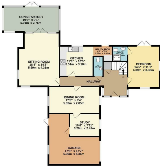
GROUND FLOOR 1412 sq.ft. (131.2 sq.m.) approx.